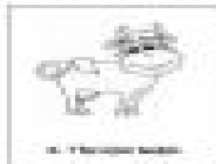
c. the pig grunts