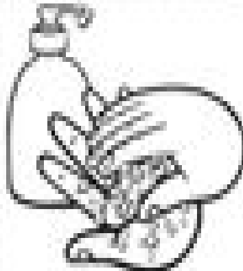
2. Soap Enjabón