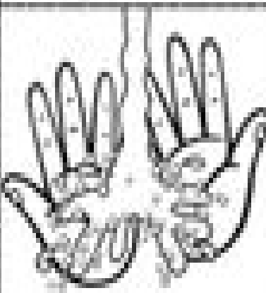
4. Rinse Enjabón