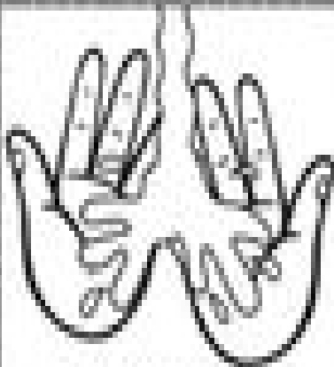
1. Wet Hands Moje las manos