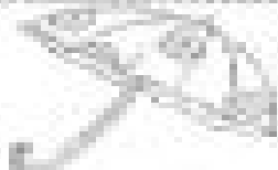
book under the umbrella