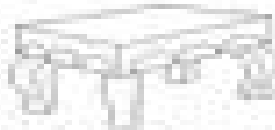
a cup on the table